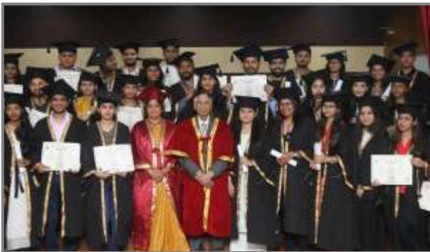
Degree Distribution Ceremony