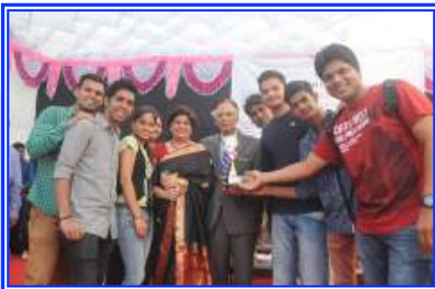
Won 'Best College Award' in 'Digvalaya' an Inter-Collegiate Competition of Dr. V.N. Bedekar Institute of Management Studies