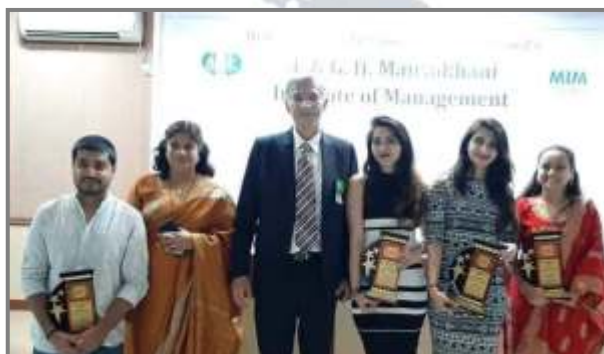
Opalina Awards - Jewels of MIM