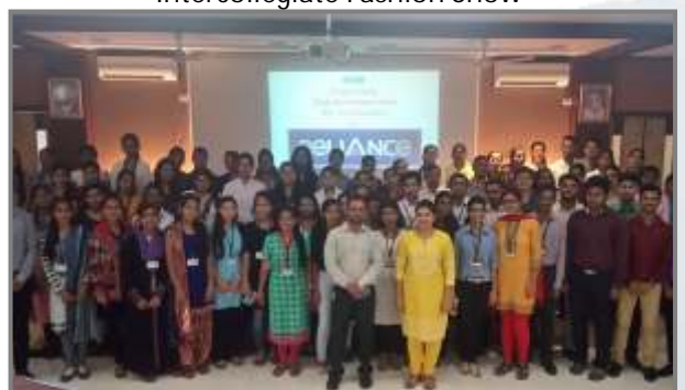
Mega Recruitment Drive - Reliance