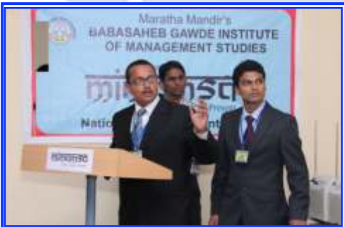
1st Prize in 'MIMAMSA' - National Paper Presentation in Babasaheb Gawde Institute of Management Studies