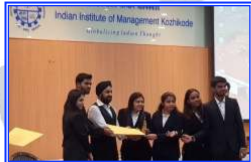
Business Plan Competition at IIM, Kozhikode