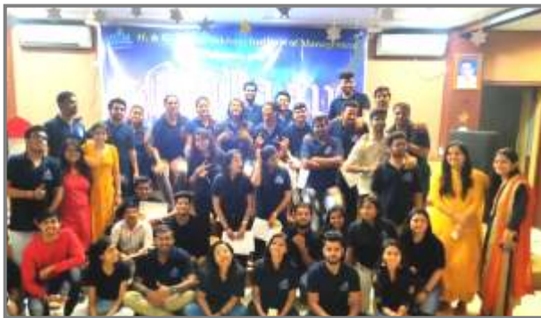
Milaap - An Inter Collegiate Management Fest