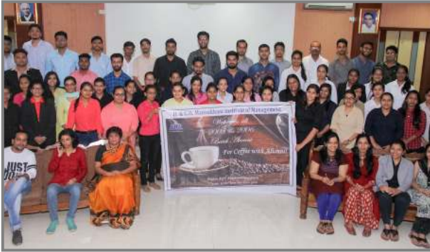
Coffee with Alumni