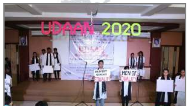
Udaan - DLE's Annual Extension Work Festival, University of Mumbai