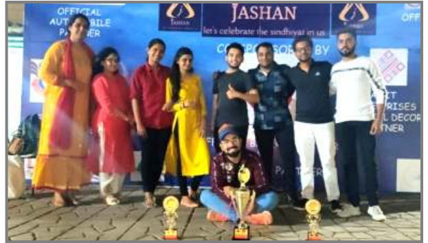
2nd prize in Spirit of Sindhi - Intercollegiate Fashion Show