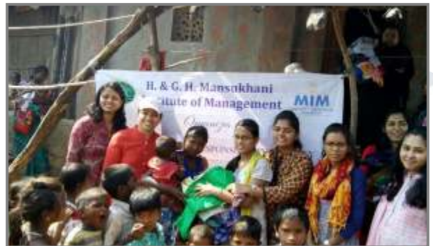
CSR Activity at Devachi Wadi (Adivasi Pada), Badlapur