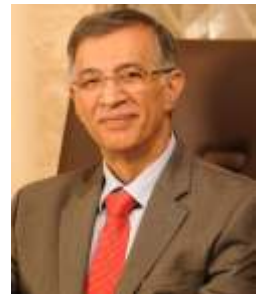
Dr. CA Niranjan Hiranandani Former President