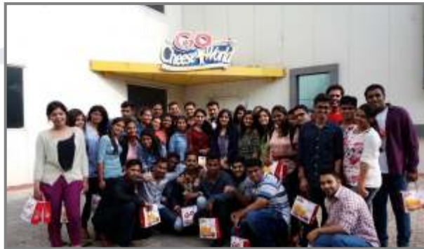
Industrial Visit to Gowardhan, Manchar, Pune