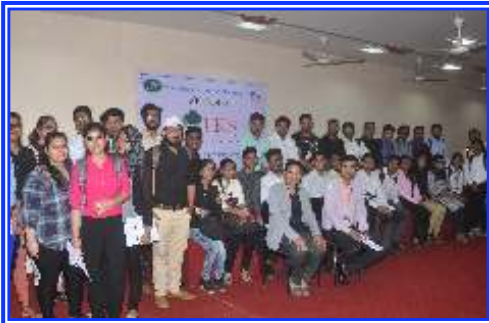
Mega Recruitment Drive - IKS Health