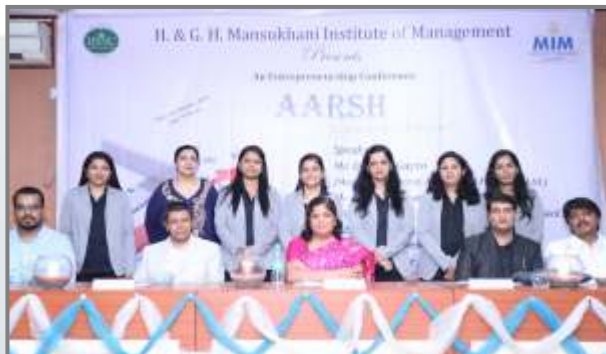
Aarsh - Reaching the Ultimate An Entrepreneurship Conference