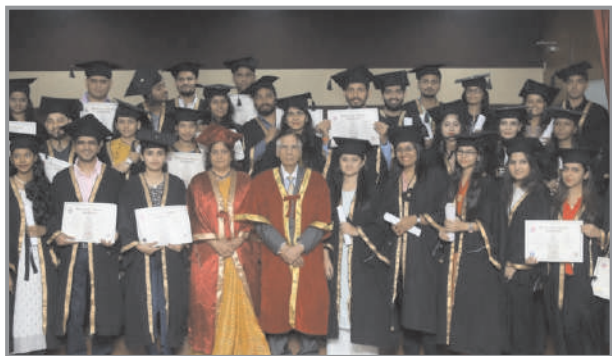
Degree Distribution Ceremony