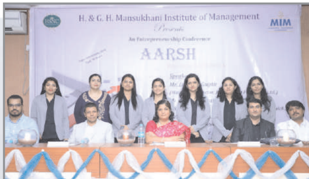
Aarsh - Reaching the Ultimate An Entrepreneurship Conference