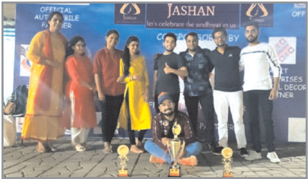
2nd prize in Spirit of Sindhi - Intercollegiate Fashion Show