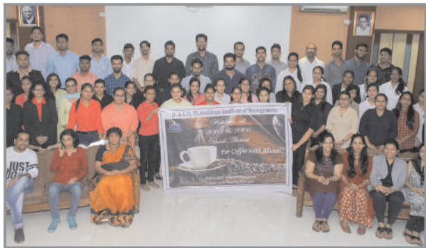
Coffee with Alumni