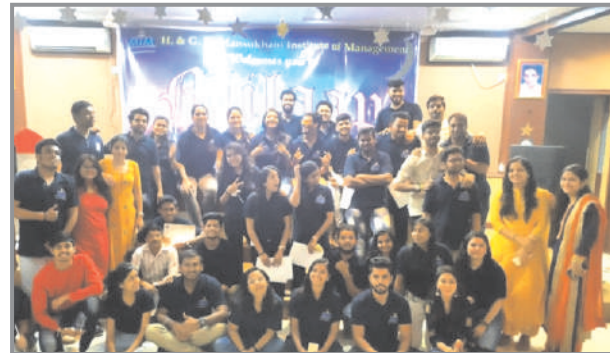
Milaap - An Inter Collegiate Management Fest