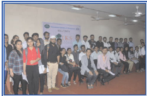
Mega Recruitment Drive - IKS Health