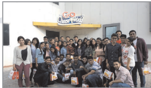
Industrial Visit to Gowardhan, Manchar, Pune