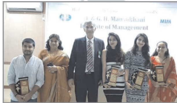
Opalina Awards - Jewels of MIM