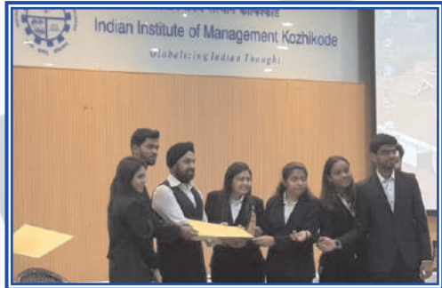
Business Plan Competition at IIM, Kozhikode