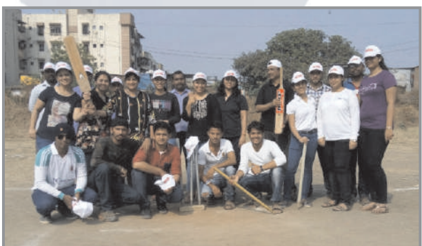
National Youth Day