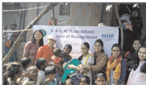
CSR Activity at Devachi Wadi (Adivasi Pada), Badlapur