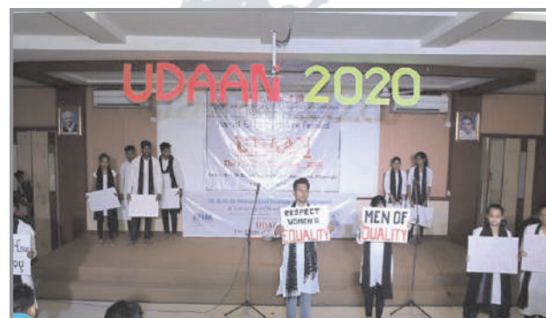
Udaan - DLLE's Annual Extension Work Festival, University of Mumbai