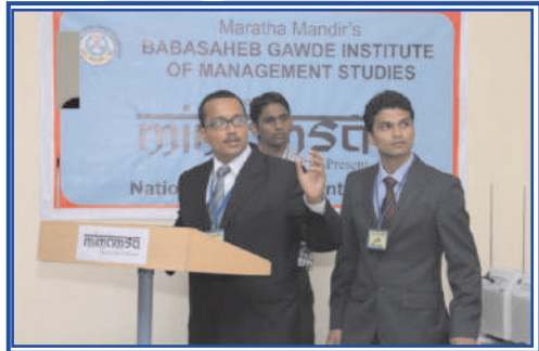
1st Prize in 'MIMAMSA' - National Paper Presentation in Babasaheb Gawde Institute of Management Studies