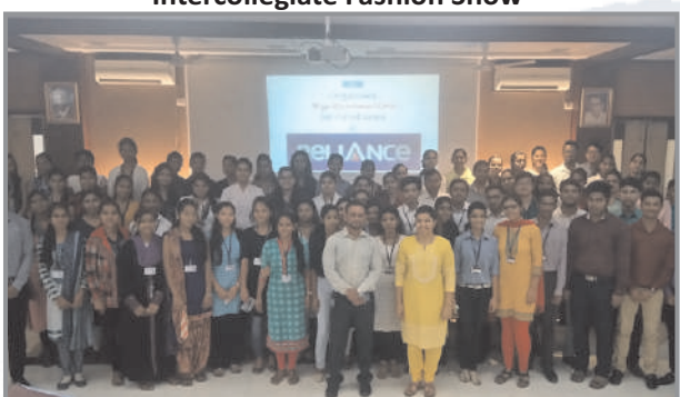
Mega Recruitment Drive - Reliance