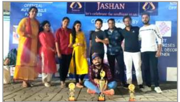
2nd prize in Spirit of Sindhi - Intercollegiate Fashion Show