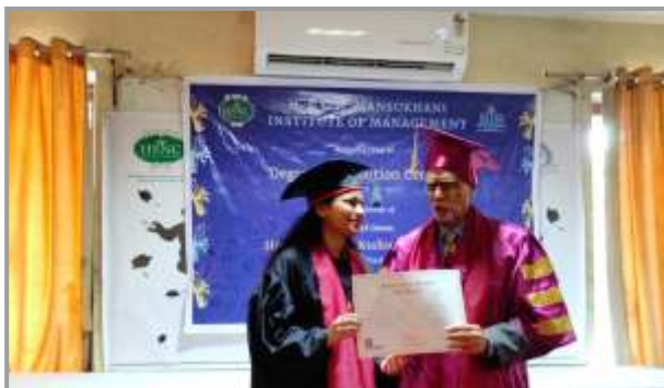
Degree Distribution Ceremony 2023