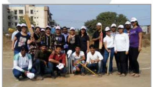
National Youth Day