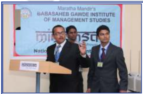
1st Prize in 'MIMAMSA' - National Paper Presentation in Babasaheb Gawde Institute of Management Studies