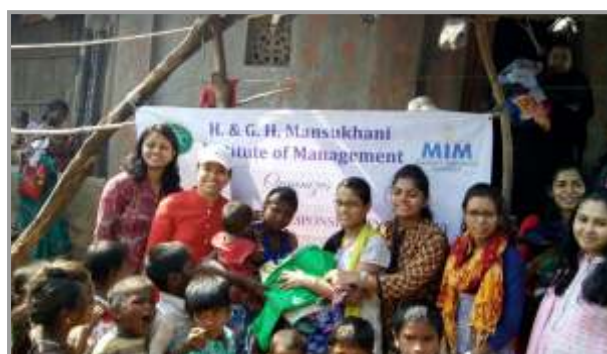
CSR Activity at Devachi Wadi (Adivasi Pada), Badlapur