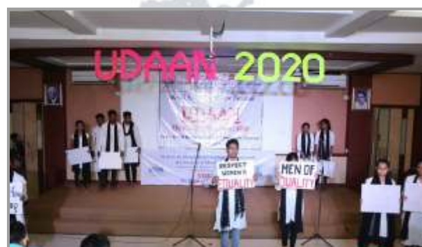
Udaan - DLE's Annual Extension Work Festival, University of Mumbai