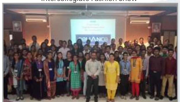
Mega Recruitment Drive - Reliance