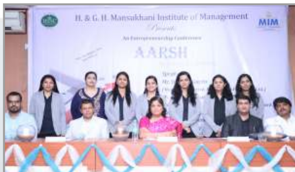
Aarsh - Reaching the Ultimate An Entrepreneurship Conference