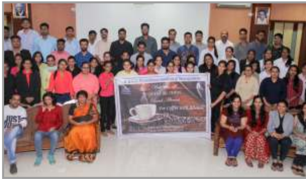
Coffee with Alumni