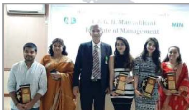
Opalina Awards - Jewels of MIM