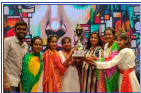
Consolation prize at the HSNCB Performing Arts Festival -2023