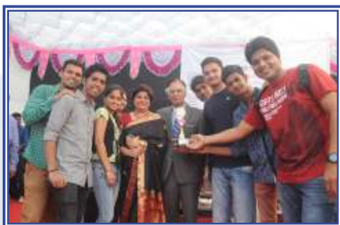
Won 'Best College Award' in 'Digvalaya' an Inter-Collegiate Competition of Dr. V.N. Bedekar Institute of Management Studies