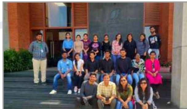
Industrial Visit to Sahyadri Farms, Nashik