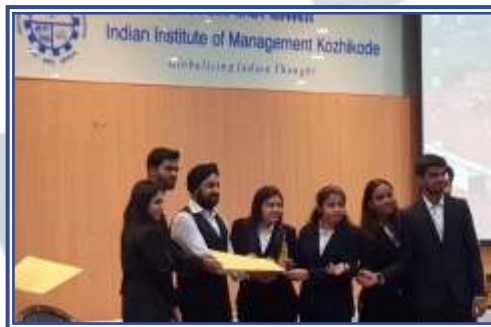
Business Plan Competition at IIM, Kozhikode