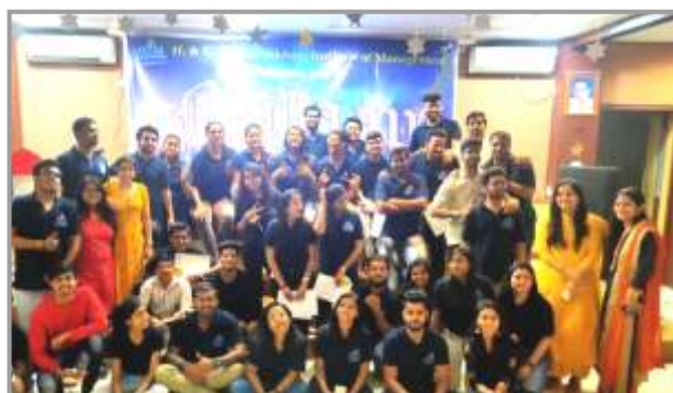
Milaap - An Inter Collegiate Management Fest